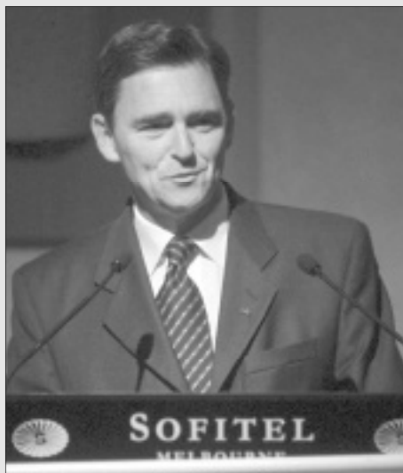
LEFT: Victorian Treasurer, John Brumby, gave a keynote breakfast address to the CEDA–Telstra Economic and Political Overview held in Melbourne in February 2001.