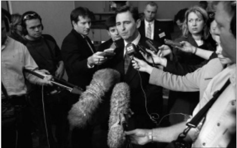
Victorian Treasurer John Brumby questioned by media after giving an address to CEDA in May 2001.