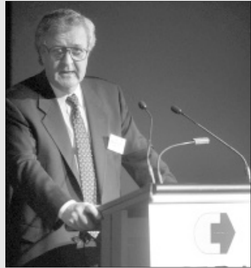
RIGHT: Governor of the Reserve Bank, Ian Macfarlane, addressed CEDA's 2000 AGM.