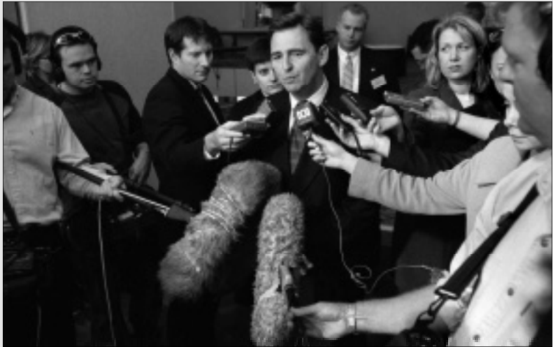
Victorian Treasurer John Brumby questioned by media after giving an address to CEDA in May 2001.