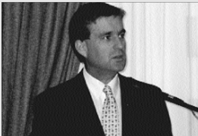
Deputy Prime Minister and Minister for Transport and Regional Services John Anderson gave a keynote address to CEDA's Regional Summit held on the Gold Coast in July 2000.