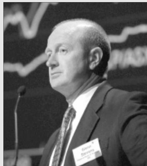
RIGHT: Glenn Stevens, Assistant Governor Economics, Reserve Bank of Australia discussed the economic outlook at the CEDA–Telstra Economic and Political Overview held in Melbourne in February 2001.