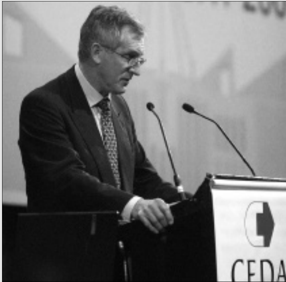
LEFT: Dr John Hewson, The Hewson Group Pty Ltd, addressed CEDA's Federal Budget Night in Melbourne in May 2001.