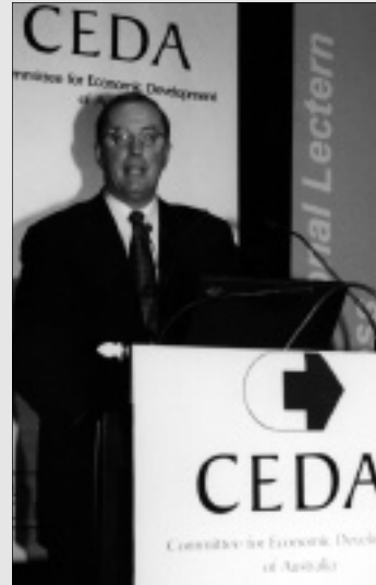
LEFT: Intel Executive Vice-President Paul Otellini addressed CEDA Sydney in April 2001.