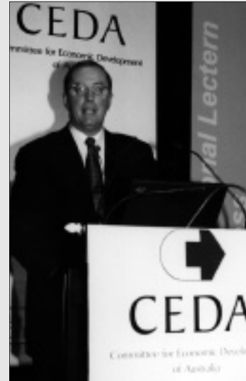
LEFT: Intel Executive Vice-President Paul Otellini addressed CEDA Sydney in April 2001.