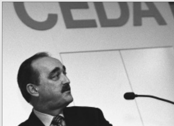
Tasmanian Premier Jim Bacon addressed CEDA's Melbourne Trustees in August 2000.