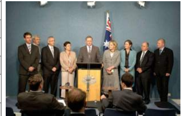
Transport Ministers, Feb 2009